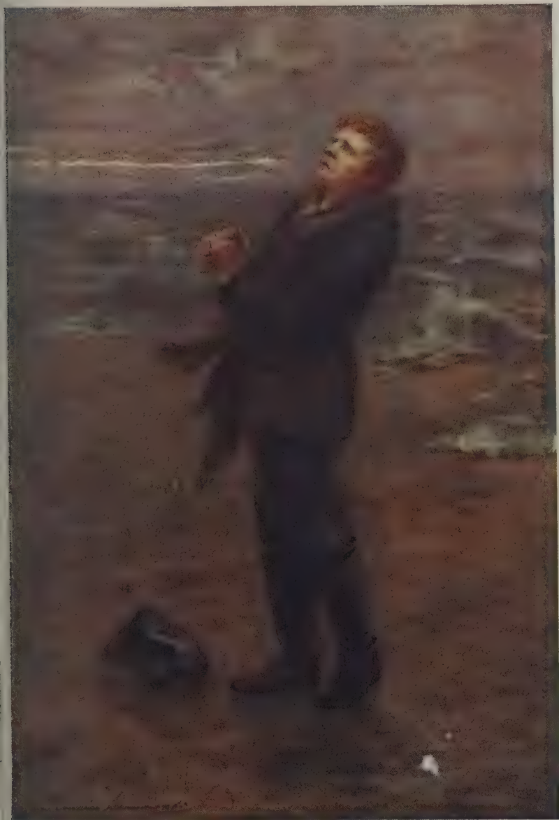
THE FACE HE TURNED UP TO THE TROUBLED SKY, THE AGONY OF HIS FIGURE, REMAIN IN MY REMEMBRANCE TO THIS HOUR